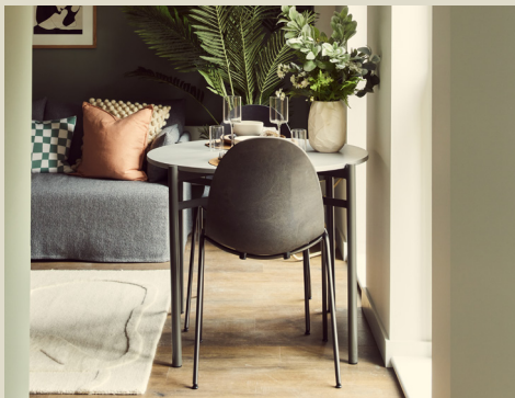
DINING TABLE & MATER CHAIRS