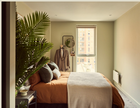
KING SIZE OTTOMAN BED