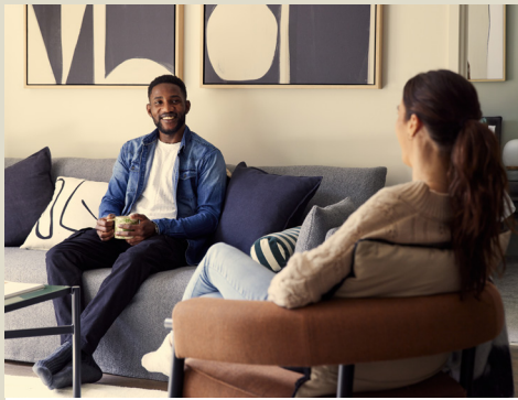
ROGER LEWIS SOFA

King size Ottoman bed with storage and bespoke bedside tables. There are also built-in wardrobes with floor-to-ceiling mirrors on the doors.